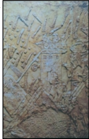
The Siege of Lachish

These stone panels were carefully removed by Layard's team and transported by barge down the Tigris and then by sea to England where they are preserved in the British Museum and can now be examined by anyone with an interest in the Bible. They are a remarkable testimony to the historical accuracy of the record we have in God's Word.