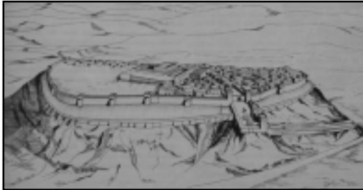
Reconstruction of Ancient City of Lachish

The story of Lachish really comes to life in the time of King Hezekiah (715-686 BC), when the armies of Assyria under king Sennacherib invaded Judah from the North, sweeping down past Jerusalem to take the strategic fortified cities in the south, and so we