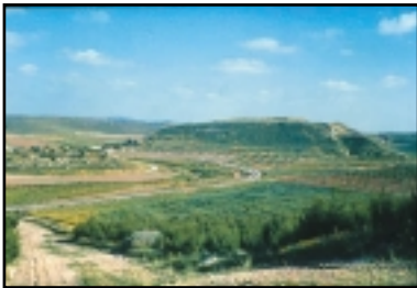
Site of Lachish

Archaeological excavations at Lachish have found at least nine layers of settlement dating from 3000 BC to the third century BC. Two